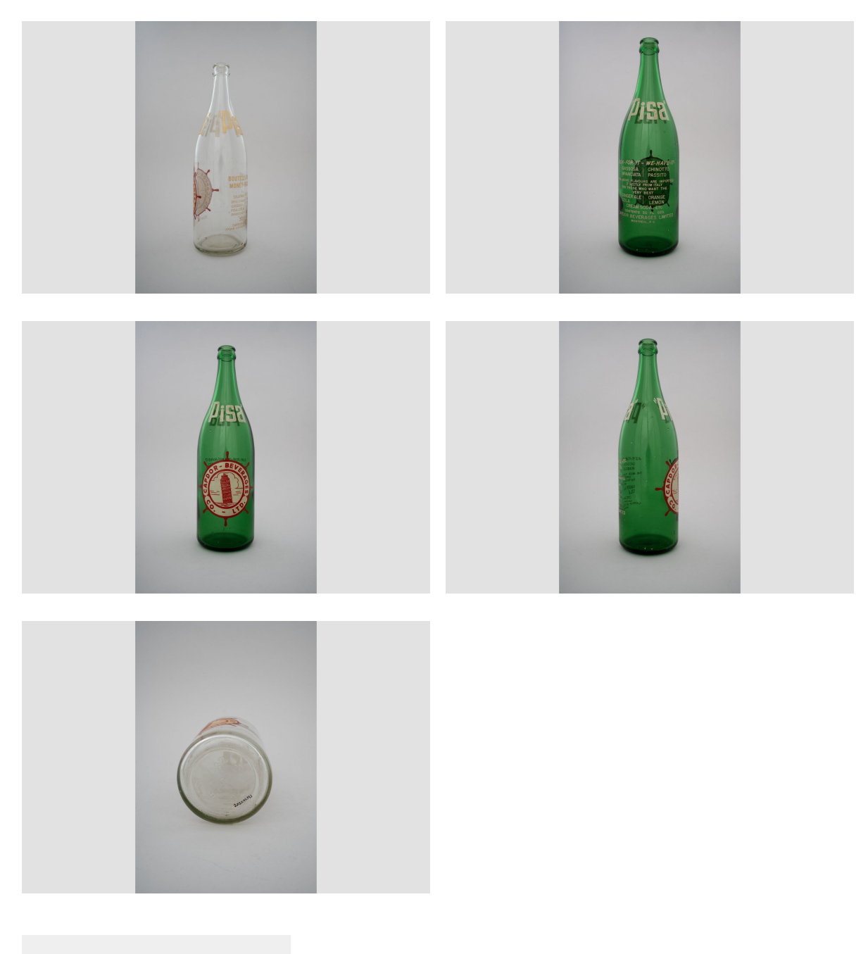
CC BY-NC-ND 4.0 license

Pisa soft drink bottles 852ml. The logo features an illustration of the Leaning Tower of Pisa in white and red. A transparent bottle and a green bottle with slightly different lettering. The transparent bottle features text in English and French, while the green one is in English only.